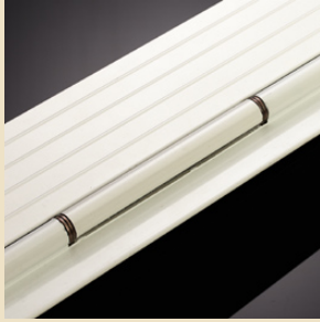
Oil impregnated bearings in each of the four hinges.