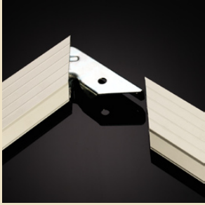
Power coated extruded aluminum door tube with oversized metal corner gusset.