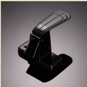
Interior latch *Standard with lock