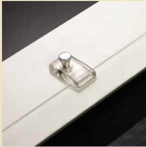
Clear, tough, polycarbonate sash retainer with knurled knob thumb screws allow easy sash and screen changes