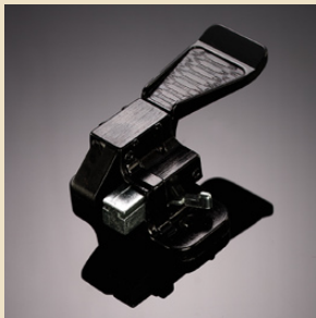
**Upgrade with mini-dead bolt (with brass and satin only)