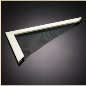
Heavy Duty Hollow extruded screen frame with aluminum wire mesh.