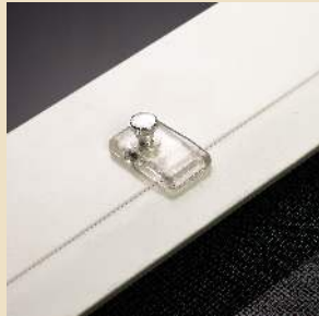
Clear, tough, polycarbonate sash retainer with knurled knob thumb screws allow easy sash and screen changes.