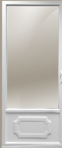
507 Single Provincial Interchangeable glass and screen.