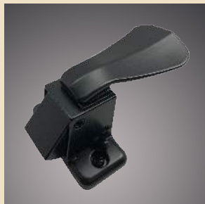
Interior latch Color matched with standard handle. *Standard with lock.

Color Options – Not all colors are available in all styles.