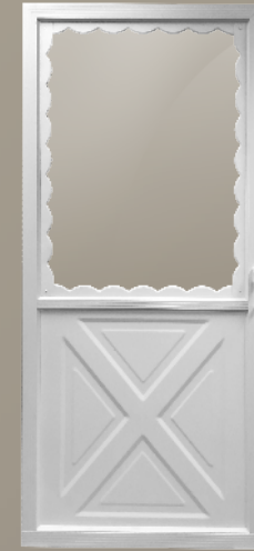
503 Colonial Interchangeable glass and screen.