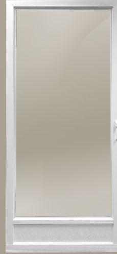
501 1-Lite Interchangeable glass and screen.