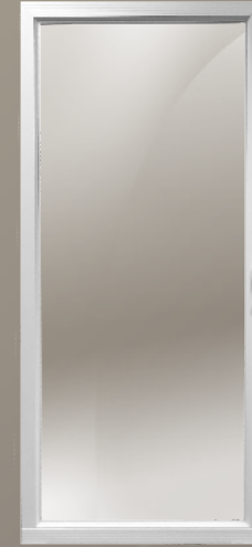
511 Fullview Interchangeable glass and screen.