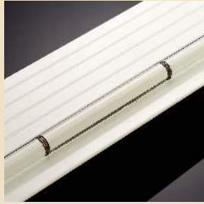
Oil impregnated bearings in each of the four hinges.