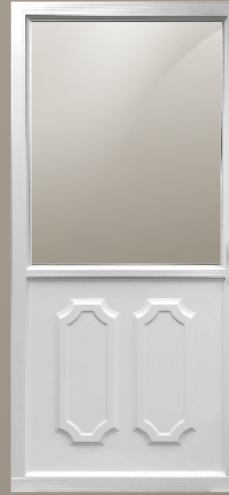
508 Double Provincial Interchangeable glass and screen.