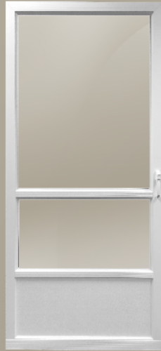
500 Hi-Lite Interchangeable upper glass and screen. Lower screen option available.