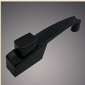
Standard Hardware Available in black or white.