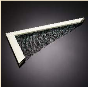
Heavy duty hollow extruded screen frame with aluminum wire mesh.