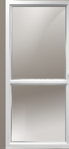
512 2-Lite Interchangeable upper glass and screen. Lower screen option available.