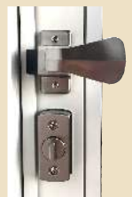
Color Matched inside latch with keyed deadbolt