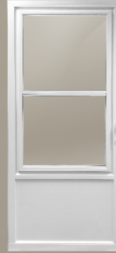
502 Self Storing All self-stored in the door. Glass easily slides up to screen for ventilation.